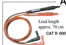
9207-10 TEST LEAD