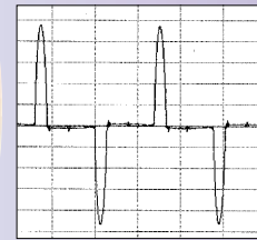
Current waveform of the inverter (primary side)